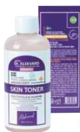
FOR OILY SKIN