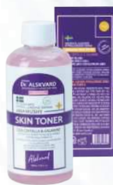
FOR COMBINATION SKIN