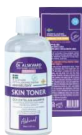
FOR DRY SKIN

THE SWEDEN DR. ALSKVARD HYPOALLERGENIC DERMA AMAMUSHI SKIN TONER CONTAINS NATURAL HEALING AND ANTI-INFLAMMATORY PROPERTIES TO BALANCE, REFRESH, AND HYDRATE YOUR SKIN.